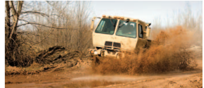
FMTV Cargo 6x6

"With the Oshkosh name, you know you are getting the highest quality products and service throughout the entire process. Our Operations department is constantly focused on continuous improvement initiatives to increase efficiencies on the FMTV manufacturing process. The end result has been truck and trailer components sent through E-Coat tanks and top coat booths on the same line under the same roof. This reduces lead times, product handling, and costs."