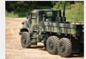
OSHKOSH MTRV OBVP