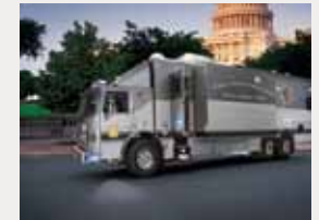
PIERCE® HOMELAND SECURITY