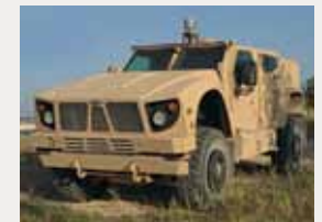
OSHKOSH TECHNOLOGY DEMONSTRATION VEHICLE