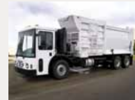
MCNEILUS® ADVANCED HEAVY HYBRID PROPULSION SYSTEM